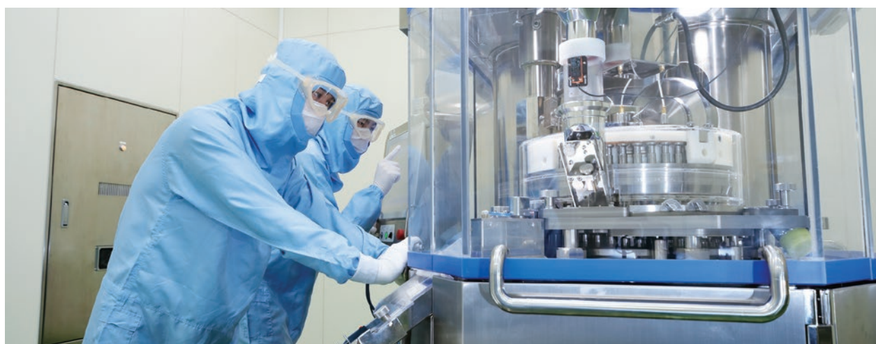
Solid dosage formulation production facility at the Yoshitomi Plant

In addition, BIKEN, a joint venture with the BIKEN Foundation's vaccine manufacturing business, began operation in September 2017. By integrating BIKEN Foundation's vaccine manufacturing technologies together with Mitsubishi Tanabe Pharma's pharmaceutical manufacturing systems and management methods, we are strengthening our platform in vaccine production in order to contribute to an even more stable supply of vaccines.