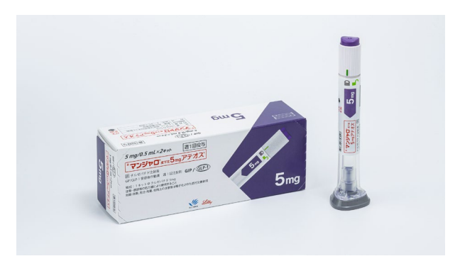
Mounjaro® subcutaneous injection 5 mg ATEOS